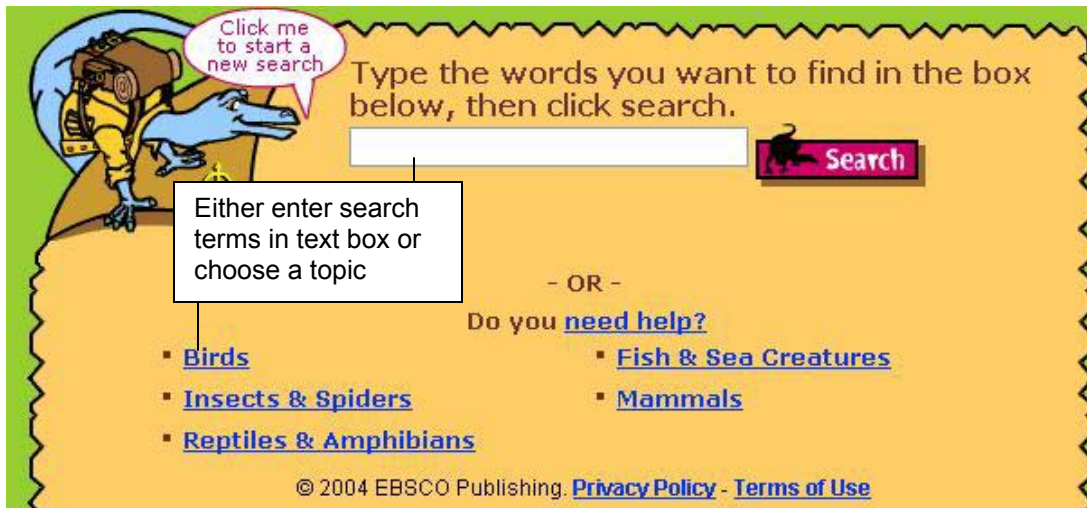
Encyclopedia of Animals Search Screen